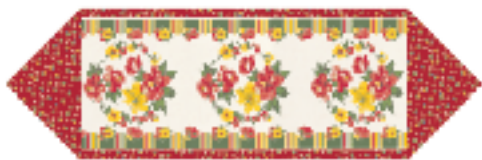
Table Runner, Version 1