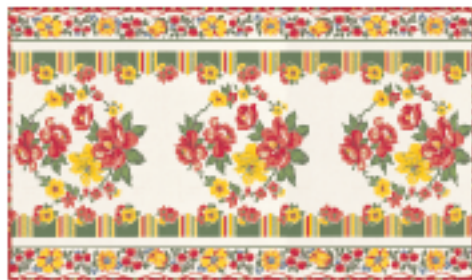
Table Runner, Version 2