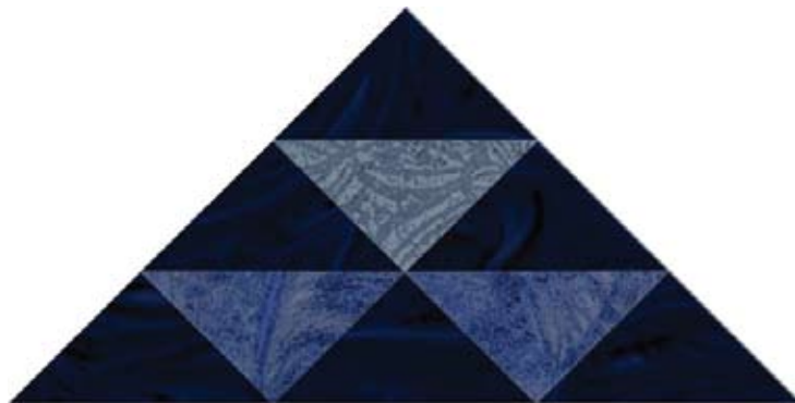
Diagram 7 Unit 2