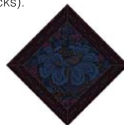
Diagram 3 Unit 1