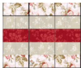
Group 3 (Make 2 Sets)