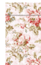
Group 2 (Make 17 Blocks)