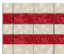
Group 2 (Make 3 Sets)