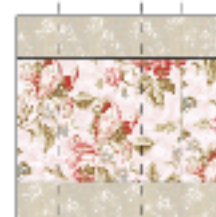
Group 1 (Make 3 Sets)